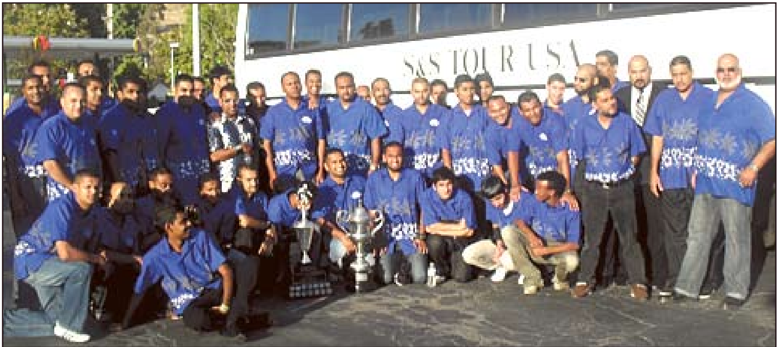
"The FANCA 2010 Winners" Team NZ in Hayward California USA